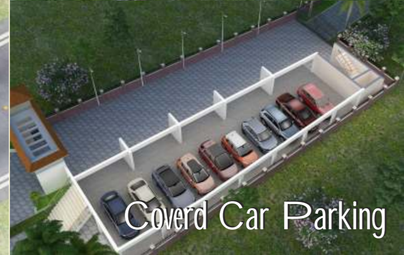
Coverd Car Parking